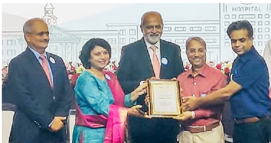
IAMM EQAS Delhi Team receiving the appreciation award