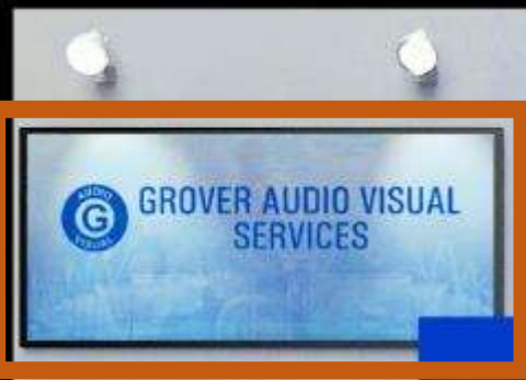
Company Logo / Fascia Name