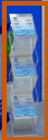
Brochure Rack with download option